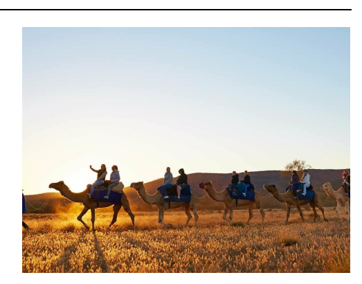
No Single Supplement!

Book your cabin now before it's too late - limited availabilty.