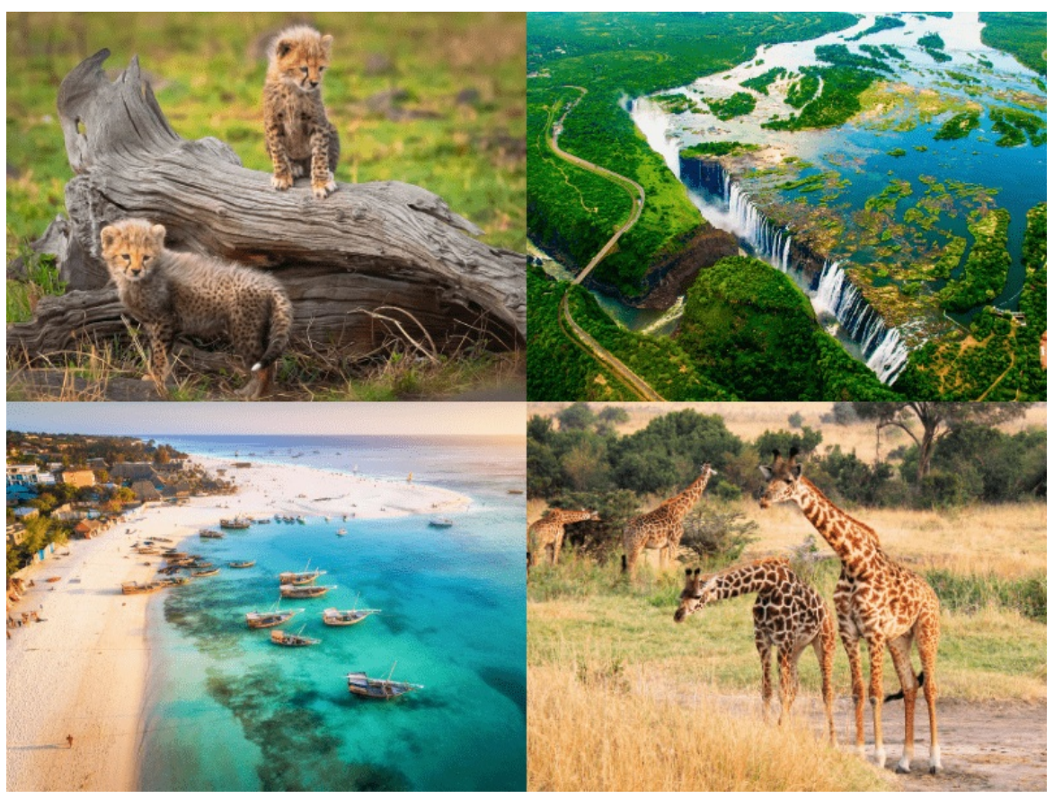
Return Internation Airfares from Australia to Africa

From $14,999 Typically $16,999 7 pp twin share