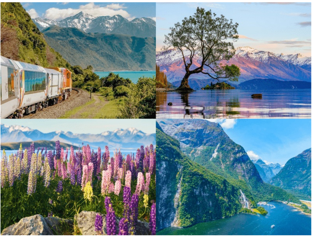
Fully Escorted Tour with flights ex Brisbane, Sydney or Melbourne Enjoy 9 Nights 4-Star Accommodation with breakfast daily 32 Seater Premium Coach with expert driver & guide A range of fantastic included meals, activities & much more! Book NOW with only a deposit

From $5,759 Typically $6,299 ★ pp twin share