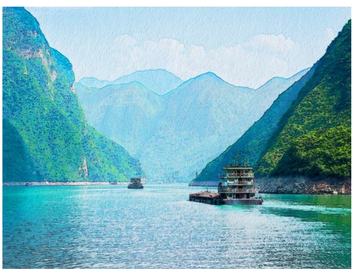
Return international flights with full-service carriers Relaxing luxury Yangtze River cruise Local English-speaking guide