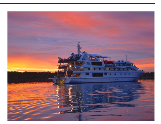
Huge savings to be had - get in touch with our team today. If you were thinking of a luxury adventure for 2022, this is the deal for you!

Your journey will begin in Darwin at the Hilton hotel, with a one-night stay. You will then make your way to the port to board your luxury cruise. You will meet your fellow passengers and crew at the Captains Welcome Drinks.